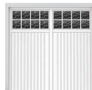
Retractable Steel Berwick