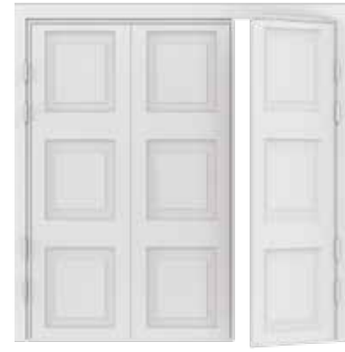
9 Panel Georgian