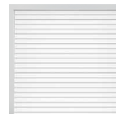
Retractable Steel Horizontal