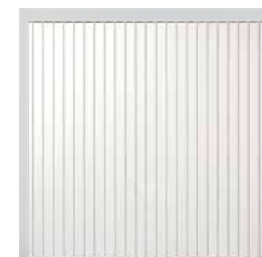
Retractable Steel Vertical